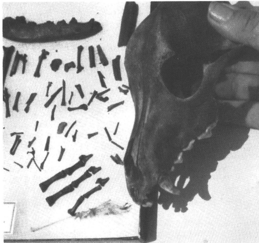
Figure 3. Fossil bones of rodents, birds, and a fox jaw from the McKittrick asphalt seeps. The finger bones of a large rodent are twice the size of a modern squirrel. See the modern squirrels hand in the lower right corner for comparison.

Additionally, the author has a coyote skull ( Canis latrans ) from Cherokee County, Iowa (see Figure 3) which is identical to coyote skulls found in the La Brea pits. It even has a bituminous coating which may have helped preserve it without petrification by mineralization. The difference is that it did not come from an asphalt seep. It came from a typical fluvial Pleistocene sand deposit, which has some post-depositional asphalt impregnation. Thus, it is at least possible to create a deposit like La Brea WITHOUT a trap mechanism.