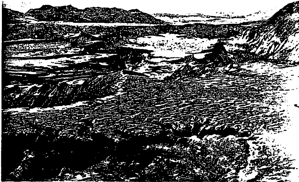
FIGURE 2. Westward view looking down the North Fork of the Toutle River in August 1984. The rockslide and pumice deposited in the region of the headwaters of the river have been eroded to a depth of more than 100 feet forming a new dendritic drainage pattern. The deep canyon on the left includes the breached remnant of the large steam explosion pit (Figure 1). The canyon on the right is shown in detail in Figure 3. Significant canyon erosion by mudflow which established the dendritic drainage pattern occurred on March 19, 1982.