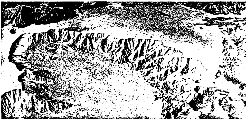
FIGURE 1. Largest steam explosion pit viewed from the east on June 18, 1980. The pit is 2300 feet long and has a flat floor of pumice deposited by the volcano's June 12 eruption. The dendritic pattern of gullies and rills forms 100 feet of relief at the margin of the pit. The pit was later breached by a mudflow on March 19, 1982, and forms the new canyon in the left side of Figure 2.

Erosion during volcanic eruptions at Mount St. Helens was by scour from steam blasts, landslides, water waves, hot pumice ash flows (pyroclastic flows), and mudflows. After the eruptions the erosion process has been dominated by sheet flooding and channelized flow of water with occasional mudflows. About 23 square miles of the North Fork of the Toutle River Valley was obstructed by two-thirds cubic mile of landslide and pyroclastic debris which has been rapidly eroded since 1980. Jetting steam from buried water and ice under hot pumice reamed steam explosion pits with associated mass-wasting processes at the margins of pits producing rills and gullies over 125 feet deep. Figure 1 shows the largest steam explosion pit on June 18, 1980, but the very pronounced rills and gullies had formed before May 23, less than five days after the pumice was deposited! The rills