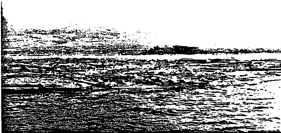
FIGURE 5. Small portion of the floating log mat in Spirit Lake. Mount St. Helens is in the background.