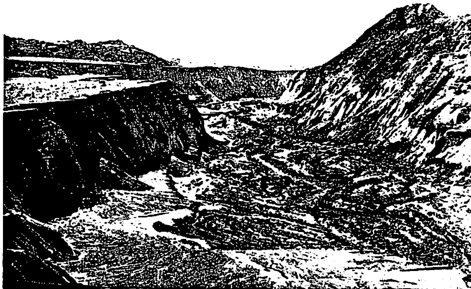
FIGURE 3. Detailed view of deep canyon on the right side of Figure 2. The flat plain of pumice deposited on May 18, 1980, was eroded to a depth of more than 100 feet by August 1984. The small creek did not erode this canyon.