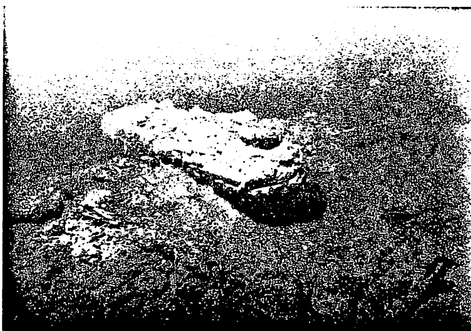
FIGURE 8. Underwater photograph of large section of tree bark lying on finer texture peat on the bottom of Spirit Lake.