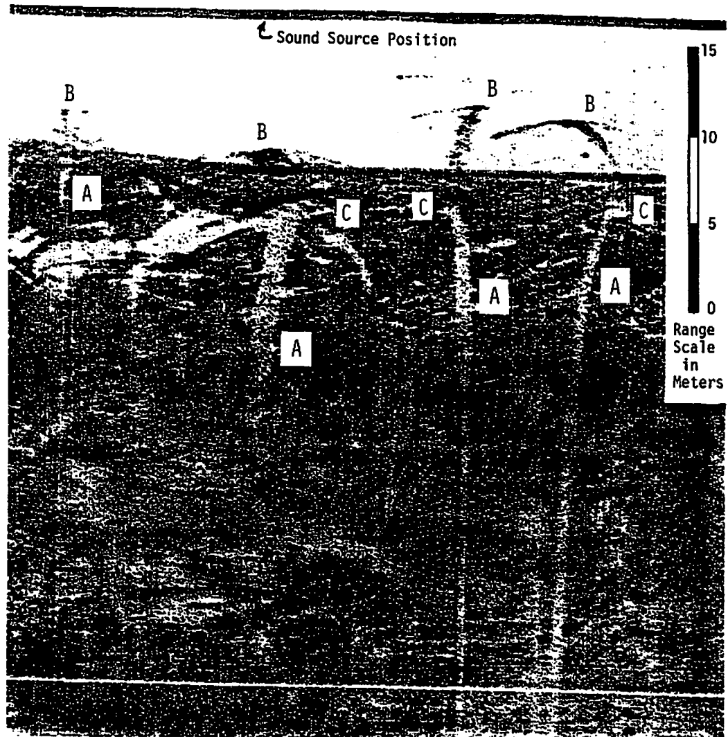
FIGURE 7. Sidescan sonar record showing several erect and prostrate trees and scattered debris on the bottom of Spirit Lake. The long light streaks (label A) are sonar shadows of upright trees. This record shows four upright trees almost directly below the sound-releasing towfish. Each upright tree produces a direct reflection seen in the water column along the top of the figure (label B). Three of the trees show evidence of outspreading root masses in shadows cast at the bases of the trunks (label C).